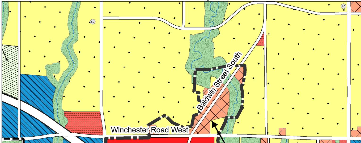
Exhibit 'A' to Official Plan Amendment #131 to the Town of Whitby Official Plan

Change from: 'Mixed-Use' to 'Residential'