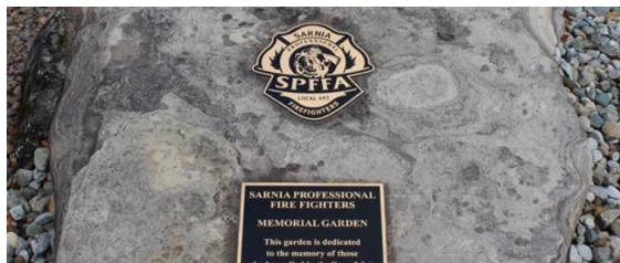
Sarnia, ON Fallen Firefighters Memorial Garden