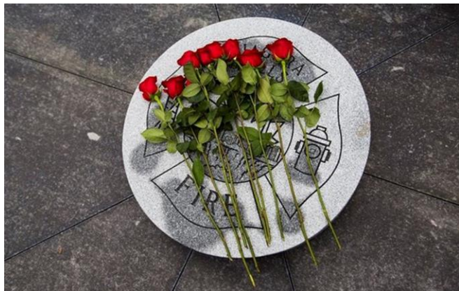
Niagara Falls, ON Fallen Firefighter Memorial