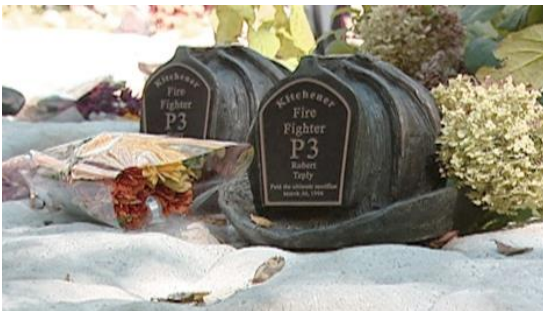
Kitchener, ON Fallen Firefighter Memorial