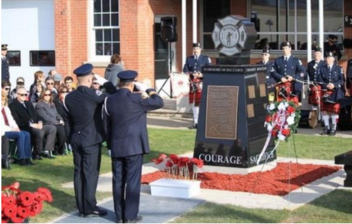
Welland, ON Fallen Firefighter Memorial

As our fallen firefighters' names are added to the memorial, they will need to be remembered individually. Commonly this is done by inscribing their name on the memorial. Additional details could include: years of service, date of passing, rank and/or age.