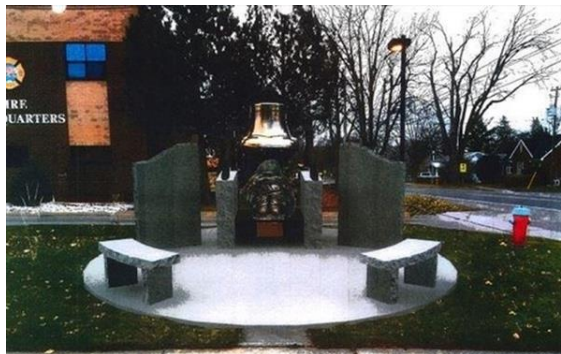
St. Catharines, ON Fallen Firefighter Memorial