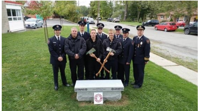
Thorold, ON Fallen Firefighter Memorial