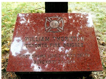
Toronto, ON Fallen Firefighter Memorial