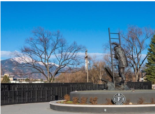
IAFF Fallen Firefighter Memorial

Often, these memorials are based on pre-existing fallen firefighter memorials, such as the International Association of Fire Fighters (IAFF) Fallen Firefighter Memorial, located in Colorado Springs, CO, or the Ontario Professional Fire Fighters Association (OPFFA) Fallen Firefighter Memorial, located in Toronto, ON.