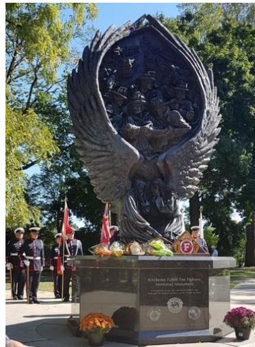
Kitchener, ON Fallen Firefighter Memorial

Granite and marble are the most commonly used stone. They are both often used in cemeteries as grave markers with inscribed the names of those who have passed. These stones are instantly reminiscent of mourning and loss.