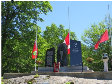
Gravenhurst, ON Fallen Firefighter Memorial