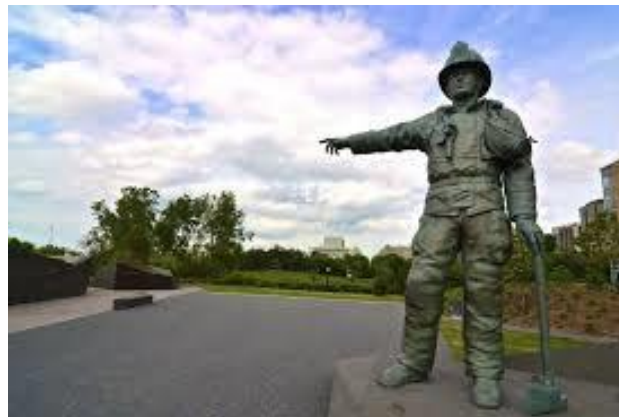
Ottawa, ON Fallen Firefighter Memorial

Cast brass or cast bronze is used more often when constructing an artistic scene and a 'larger than life' depiction of firefighting.