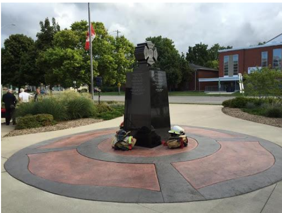
London, ON Fallen Firefighter Memorial