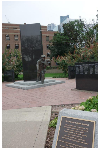
OPFFA Fallen Firefighter Memorial

The Regional Municipality of Durham is unique in Ontario, as none of its cities with fulltime fire services have a memorial for their fallen firefighters. This is despite the fact there have been many LODDs across our region. Therefore, this gives Whitby the exclusive opportunity to be the first in the region to showcase their honour for these brave firefighters.