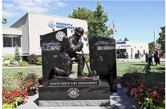
North Perth, ON Fallen Firefighter Memorial

Finally, both mediums used together can be very visually appealing.