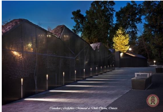
Ottawa, ON Fallen Firefighter Memorial