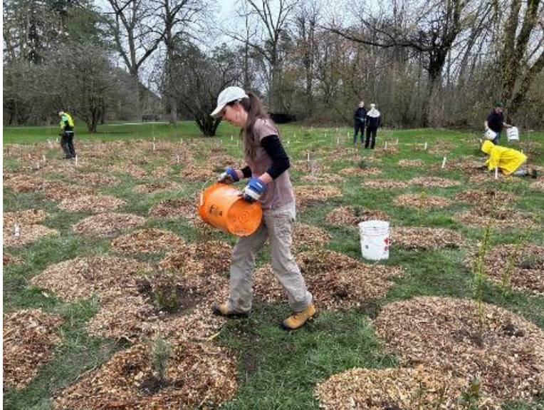
Figure 4. Mulching trees at the Earth Day Tree Planting at D'Hillier Park.