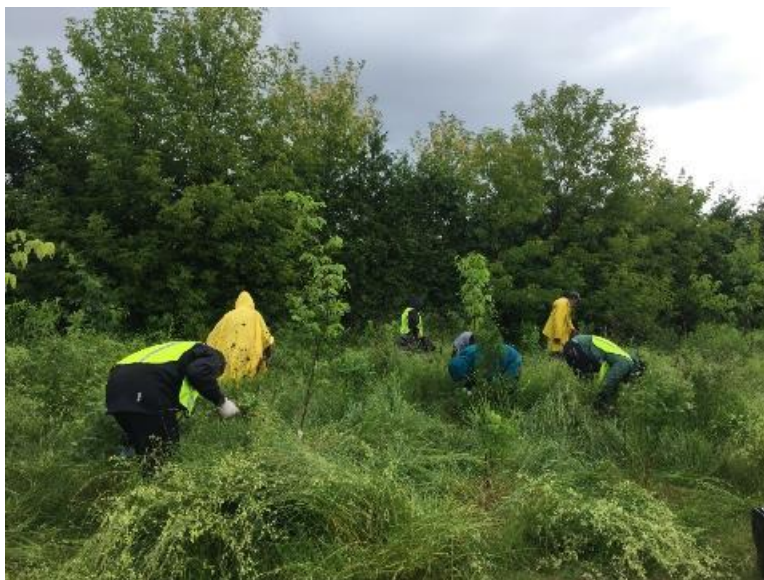
Figure 5. Volunteers pulling invasive species at LEAF community maintenance event at Rosedale Park.