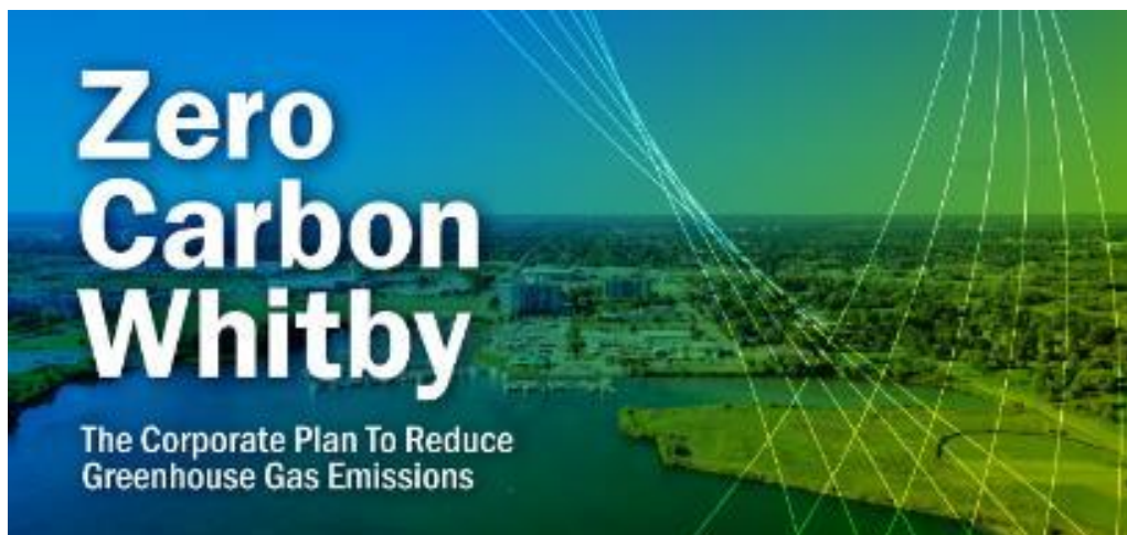
Figure 13. Zero Carbon Whitby

Zero Carbon Whitby was endorsed by Council in March 2021; this plan serves as the Town's Corporate Energy Management Plan and Corporate Climate Adaptation Plan.