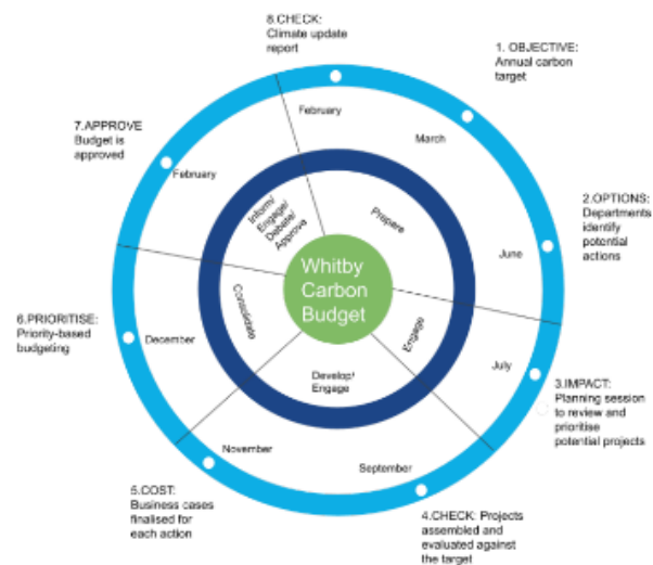
Figure 14. Town of Whitby Budget Cycle Incorporating the Carbon Budget.

With Council’s endorsement of the Zero Carbon Whitby Costing Study, in the Fall of 2022, the carbon budget process and the list of Zero Carbon Projects for 2023 were integrated into the 2023 capital budget planning process (Figure 14). This ensured that the Zero Carbon Whitby Framework has been embedded within the municipal fiscal budget process and helps with the ongoing implementation and monitoring of the Town’s actions, in alignment with emission reduction targets.