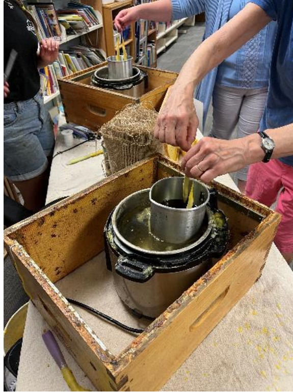
Figure 2. Participants creating hand-dipped beeswax candles.