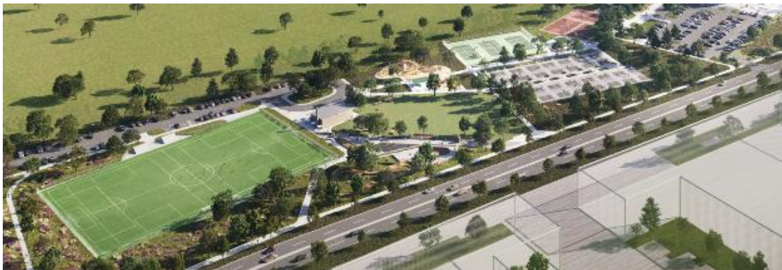
Figure 1. Rendering of the Proposed Park for the Whitby Sports Complex.

The new complex will be located on the west side of Baldwin Street South, south of Highway 407, and will include the Town's largest park investment to date. Park facilities include a full-size lit outdoor artificial turf sports field, three (3) lit tennis courts, fourteen (14) lit pickleball courts, a skateboard park and pump track, three (3) lit multipurpose courts, a playground, open greenspace, plazas, extensive native meadow, and tree plantings.