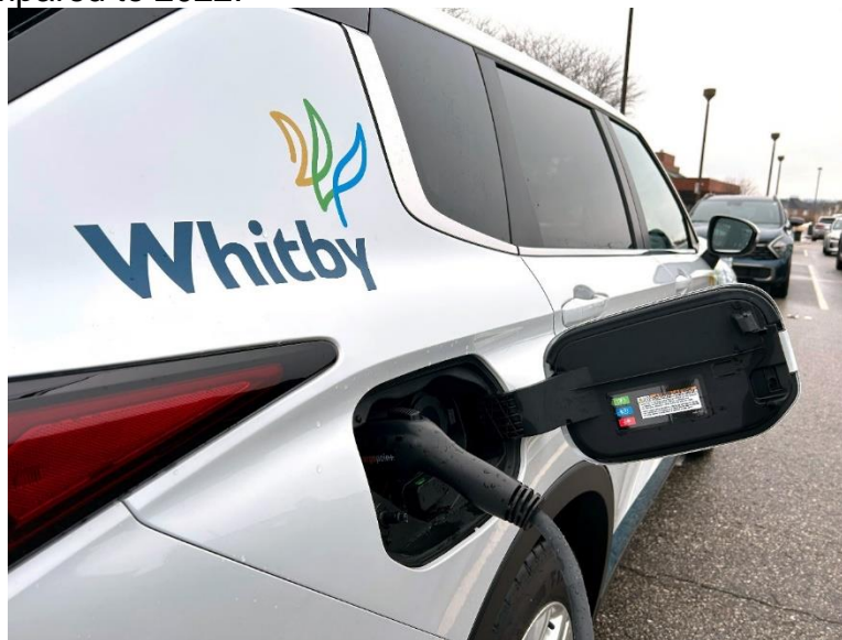
Figure 11. Town of Whitby Plug-in hybrid vehicle.

Fleet Services continued to electrify its fleet by purchasing 10 Plug-in Hybrid vehicles that can utilize the EV charging station installed in the Operations Yard. Through the increased use of EVs and replacement of older higher emitting vehicles in 2023, the Town was able to reduce its fleet energy and GHG emissions by 973,680 kWh and 244 tCO 2 e when compared to 2022.