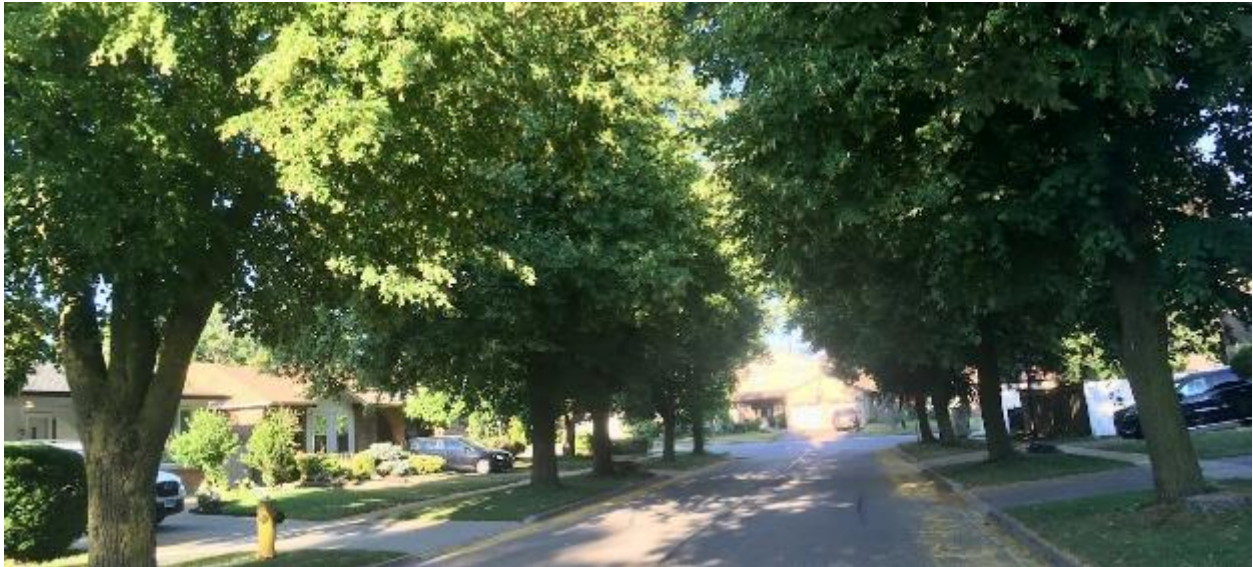
Figure 7. Whitby Urban Forest Streetscape

inventory of outstanding trees, with the majority located in parks, to be included in the Town's tree canopy analysis.