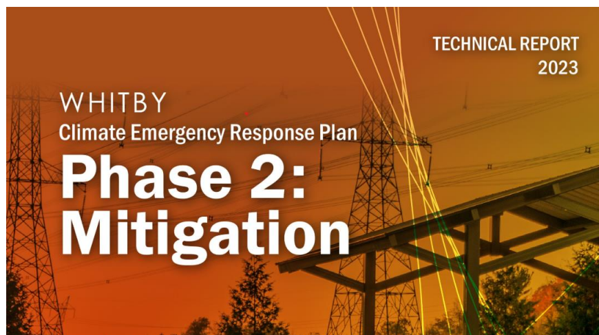
Figure 12. Whitby's Climate Emergency Response Plan - Phase 2: Mitigation

In December 2023, Climate Emergency Response Plan, Phase 2: Mitigation was completed and endorsed by Council. Phase 2 focuses on climate mitigation and identifies the sources of GHG emissions in Whitby, as well as the flow of energy across the community. The development of the Mitigation Plan included modelling the size of the climate challenge in Whitby. The Plan provides guidance and recommendations to meet the Town's community-wide GHG emissions reduction target of net-zero by 2045.