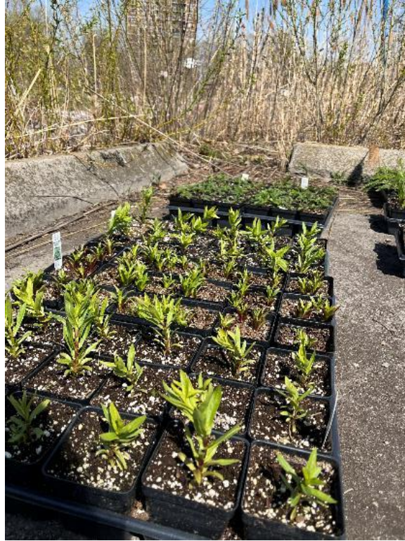
Figure 8. Trays of native plants and shrubs.