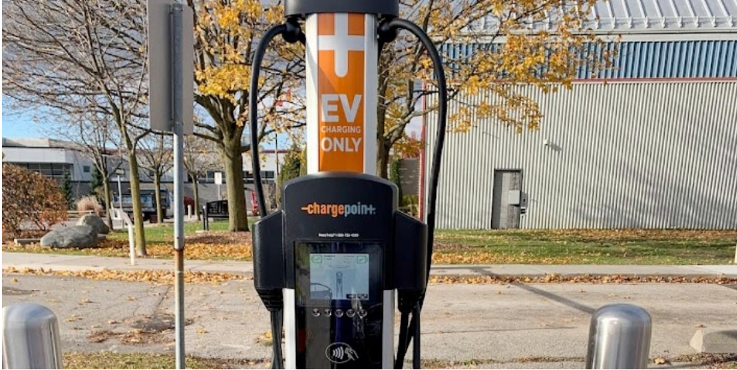
Figure 10. EV Charging Station