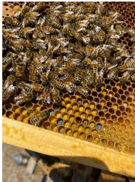
Figure 9. Bees on the Town's urban rooftop beehive.

The Town has an urban beehive on the rooftop of Town Hall, sponsored by Elexicon Energy and maintained by Alveole Urban Beekeepers. The Town extracts approximately 10 kilograms of honey from its rooftop beehive each year. The honey is bottled into 100 small jars and gifted to volunteers and handed out as prizes during community events.