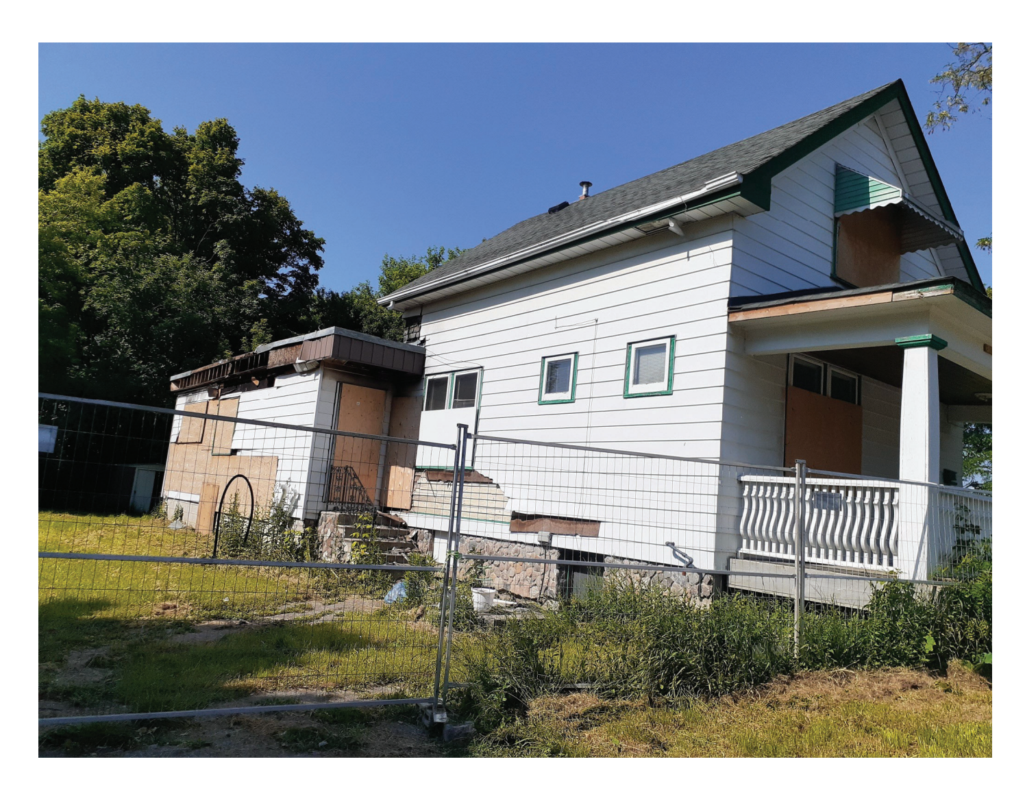
Of fire damage to existing house at 114 Keith Street, Whitby, Ontario,