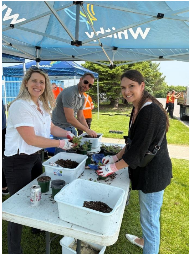
Figure 7. Town staff repotting native plants to support the Seeds for Bees nursery.

The Seeds for Bees native plant nursery has been continuously growing. A staff event was held on June 11, 2025, in celebration of Pollinator Week (June 16 to 22, 2025) to assist the Horticultural Team with the nursery. Town staff helped repot 1,630 native plants. These plants were then planted at several Town parks including Jeffrey Park, Chelsea Hill Park, Darren Park, and Lynde Creek Park.