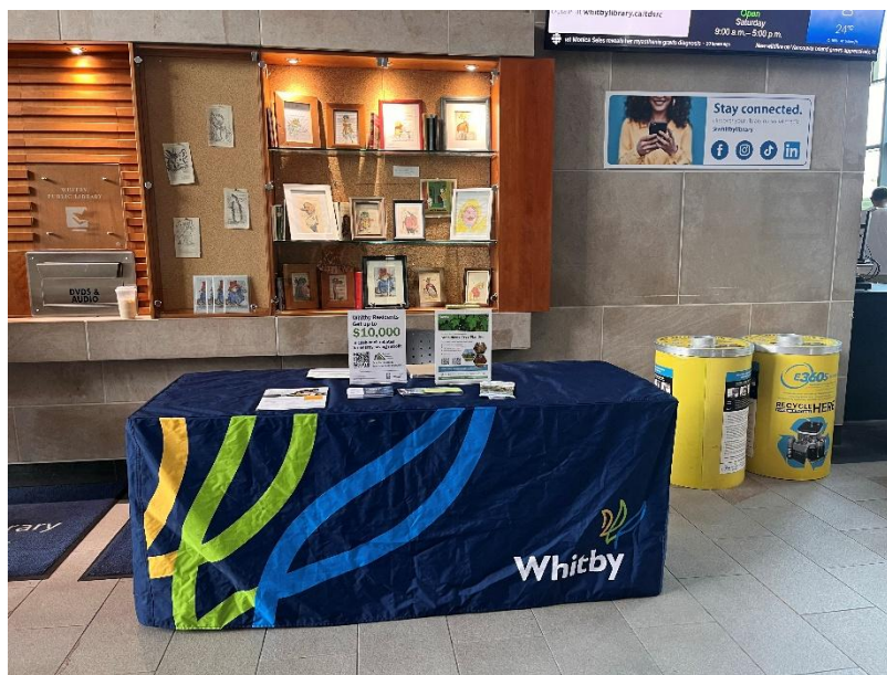
Figure 8. Whitby Central Library pop-up booth.

During the summer of 2025, Sustainability staff hosted an information table in the lobby of the Whitby Public Library, Central Branch to promote the Durham Greener Homes program, LEAF's Backyard Tree Planting program, upcoming sustainability events, and other sustainability initiatives (Figure 8). Outreach sessions took place on July 3, July 7, July 9, July 16, August 13, and August 20.