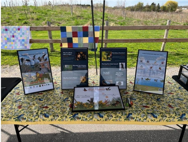
Figure 2. Table display with information on migratory birds at World Migratory Bird Day event.