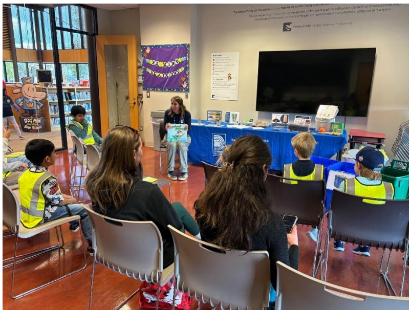
Figure 4. Participants learning about waste management at the Whitby Public Library, Brooklin Branch.

In partnership with the Whitby Public Library, Brooklin Branch and Durham Region, a family-friendly workshop was delivered on the world of waste management in celebration of Waste Reduction Week. 13 participants learned about the importance of responsible waste management through a variety of activities including a topic-specific story, hands-on activities including waste sorting, and identifying ways that they can participate in responsible waste management.