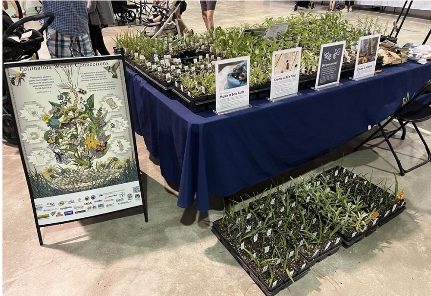
Figure 3. Native plants and pollinator education signage on display at the Town's booth during the Brooklin Spring Fair.