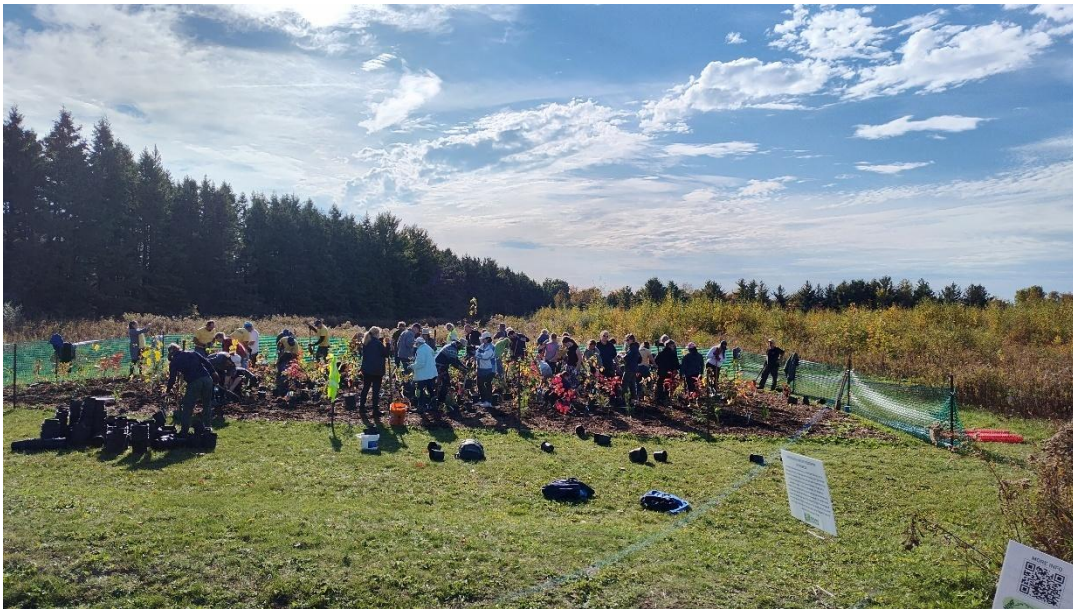
Figure 10. Volunteers planting trees to create a mini-forest at Heber Down Conservation Area.