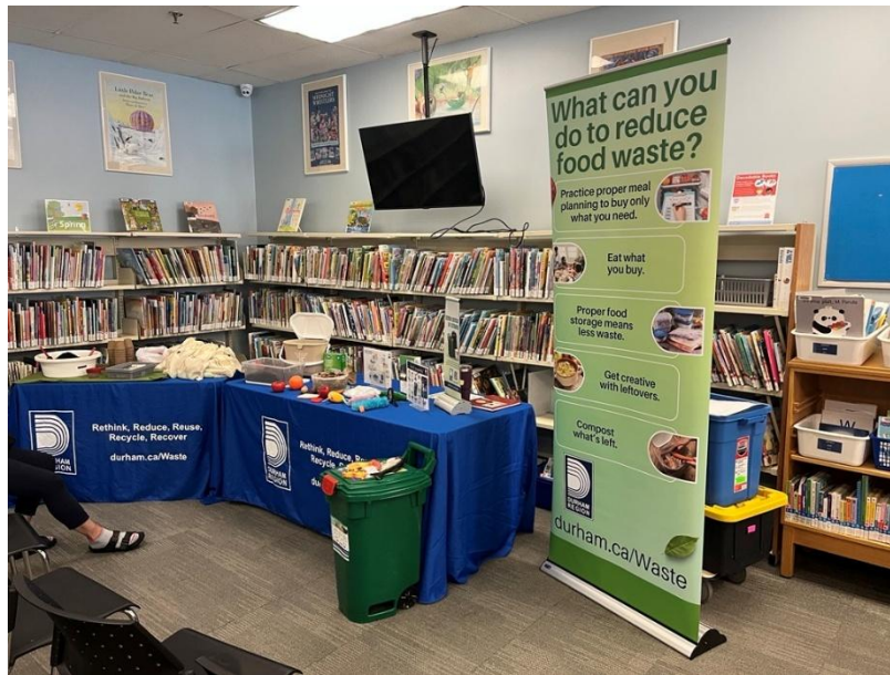
Figure 1. The Compost and Green Bin Presentation set up by Durham Region at the Whitby Public Library, Rossland Branch.

On Wednesday, April 23, 2025, Sustainability partnered with the Whitby Public Library, Rossland Branch and Durham Region, Works Department, to educate residents on best waste management practices. A Waste Management Technician from Durham Region presented to 15 participants on strategies to reduce waste and composting best practices including how to use a backyard composter for your kitchen scraps.