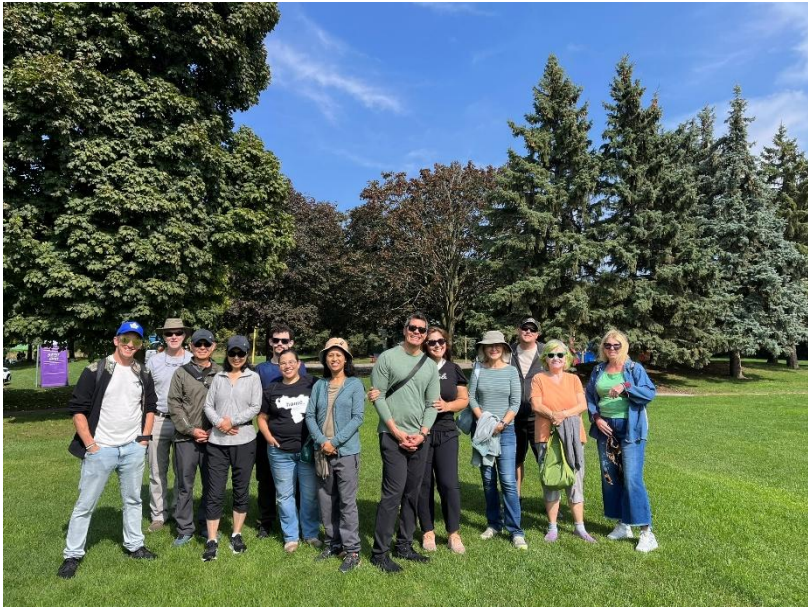
Figure 6. Participants at the LEAF Tree Tour on Saturday, September 27, 2025, at Rosedale Park.

The total 1,063 trees planted as part of LEAF programs in 2025 will save approximately 4,622 tCO 2 e through sequestration and reduced air pollution. This is equivalent to taking 1,005 cars off the road for one year.