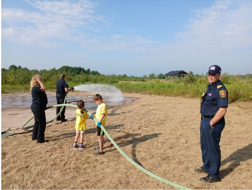
Figure 9. Volunteers and the Fire Department watering the site.