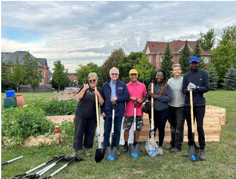
Figure 5. Community members at the Civic Community Garden.

In June 2025, the Civic Community Garden launched beside the Whitby Civic Recreation Complex at 555 Rossland Road East. This resident-led initiative offers dedicated space for growing fresh, healthy food in Whitby. The garden features beds that are planted, maintained, and harvested by community members. The goal is to improve access to nutritious food, support local food production, and help address food insecurity. The space also supports educational programming and youth-focused planting events, creating opportunities for residents to learn, grow, and connect.